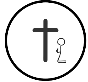
Christ is in the Center of their Life